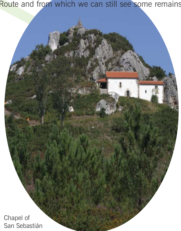
Chapel of San Sebastián

A medieval tower rose up in the summit of the Peak, that protected the entry of Compostela on the Silver Route and from which we can still see some remains.