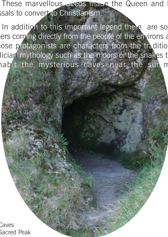
Caves Sacred Peak

In addition to this important legend there are some others coming directly from the people of the environs and whose protagonists are characters from the traditional Galician mythology such as the moors or the snakes that inhabit the mysterious caves near the sun mit.